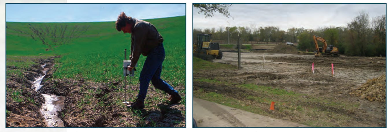
Figure 2. Examples of activities that can lead to increased soil erosion in (left) an agricultural setting and (right) an urban setting.

Raindrops hitting a soil's surface and the movement of water (runoff) across it cause soil erosion. Disturbed soil, lack of vegetation, or both amplify such impacts, increasing erosion. Two examples of soil disturbance are shown in Figure 2.