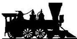
"The Switch 1896"